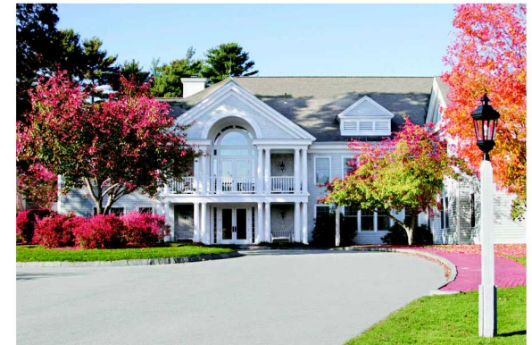
Arnold Hall Conference Center

A conference to encourage fathers in their role of raising men and women of character and vision